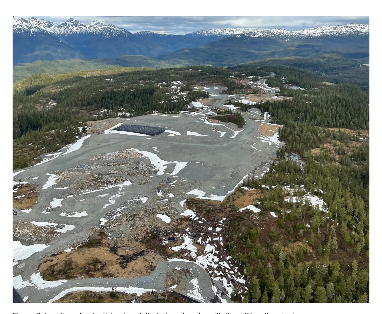
Figure 2. Location of potential polymetallic hub and spoke mill site at Kitsault project